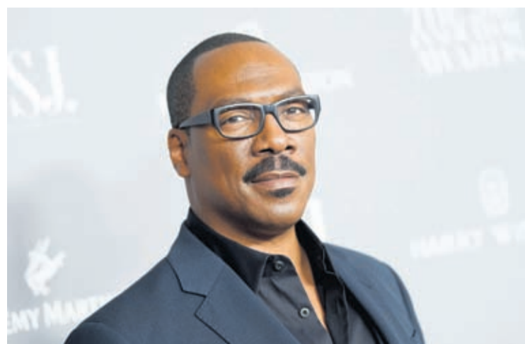
Honoree actor-comedian Eddie Murphy attends the WSJ. Magazine 2019 Innovator Awards in New York on Nov. 6, 2019.

NEW YORK (AP) — Eddie Murphy will receive the Cecil B. DeMille Award at the 80th Golden Globes, the Hollywood Foreign Press Association announced Wednesday. The honorary award for the comedian and actor adds to a broadcast that's taking shape after two years of scandal and backlash tarnished the Globes. After taking the previous Globes off the air, NBC will telecast the ceremony Tuesday, Jan. 10, with comedian Jerrod